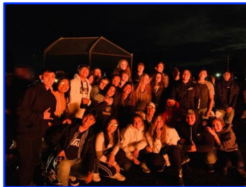
The senior class poses for a picture at the bonfire.

Students stand around the bonfire Friday.